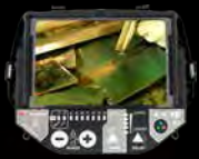
G5-03VC (Part No. 637730) - 73×109mm Viewing Area - Shades 3/5, 8-14 - Variable Colour & TAP Technology $1,600 ex GST