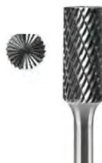
LOCH DOUBLE CUT CYLINDER WITH END CUT BURR 12 X 25MM