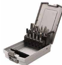
LOCH 10 PIECE DOUBLE CUT BURR SET