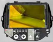
G5-01TW (Part No. 617820) - 73×109mm Viewing Area - Shades 2.5/5, 8-13 $1,900 ex GST