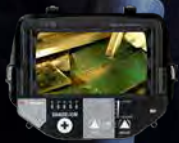
G5-03NC (Part No. 637710) - 55×107mm Viewing Area - Shades 3/5, 8-12 $1,350 ex GST