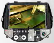
G5-01VC (Part No. 617830) - 73×109mm Viewing Area - Shades 3/5, 8-14 - Variable Colour Technology $2,100 ex GST