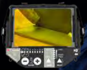
G5-03TW (Part No. 637720) - 73×109mm Viewing Area - Shades 2.5/5, 8-13 - TAP Technology $1,500 ex GST